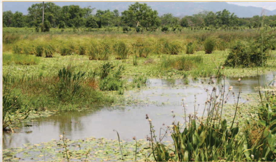
Wetland restoration project, Puerto Rico.

The new rule will improve the ecological success of compensatory mitigation efforts through better site selection, the use of a watershed approach for planning and project design, and use of ecological success criteria to evaluate and measure performance of mitigation projects. Using a watershed approach, mitigation project sites will be selected to offset permitted losses of aquatic resources and to provide ecological benefits to an entire watershed.