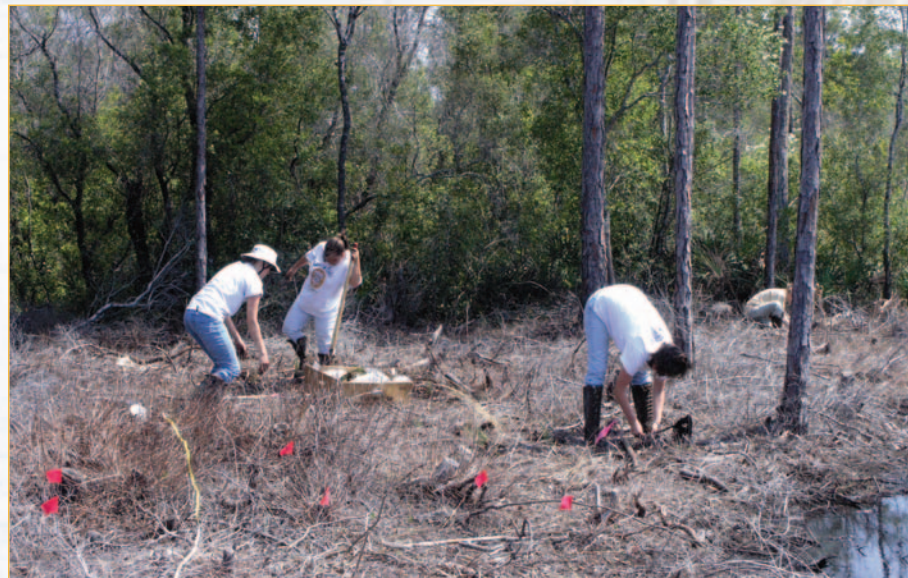
Wetland mitigation planting project, Florida.

Permittee-responsible mitigation: Individual projects constructed by permittees to provide compensatory mitigation for activities authorized by Corps of Engineers' permits.