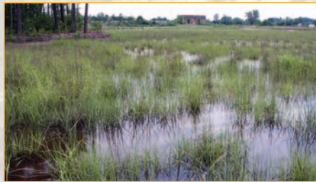
Wetland creation—second season.