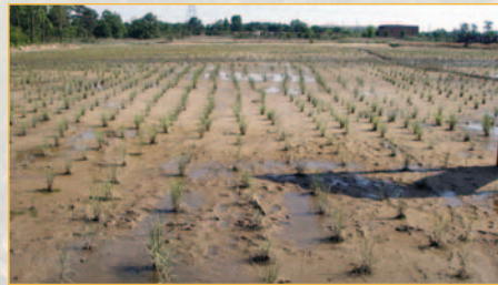
Wetland creation—first season. Elizabeth River, Virginia.

Each year thousands of property owners undertake projects that affect the nation's aquatic resources, such as wetlands and streams. Before property owners may proceed, a permit from the U.S. Army Corps of Engineers is often required to satisfy the requirements of the Clean Water Act or the Rivers and Harbors Act of 1899. Through its regulatory program, the Corps of Engineers ensures that any environmental impact on aquatic resources from these projects is avoided and minimized as much as possible. In some cases, the Corps may require compensatory mitigation to offset the losses of aquatic resources. The Corps of Engineers authorizes approximately 100,000 projects per year.