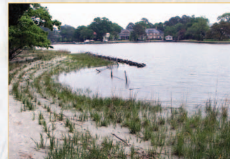
Wetland creation—first season. Lafayette River, Virginia.

The rule also preserves existing mitigation requirements by ensuring that environmental impacts are avoided and minimized wherever possible. The rule does not affect the Corps of Engineers' current regulatory jurisdiction under Section 10 of the Rivers and Harbor Act of 1899 or Section 404 of the Clean Water Act.