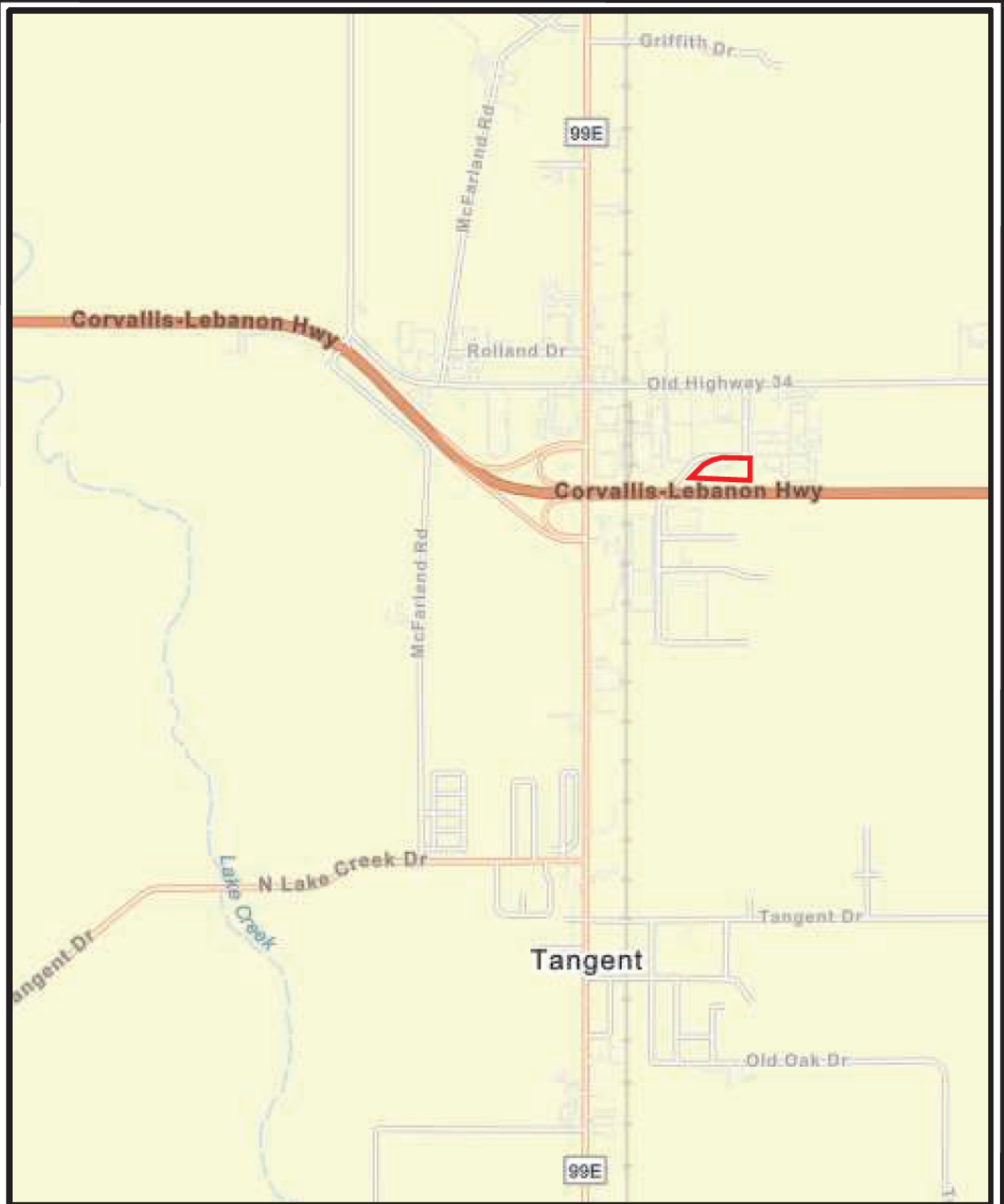
FIGURE 1 Vicinity Map