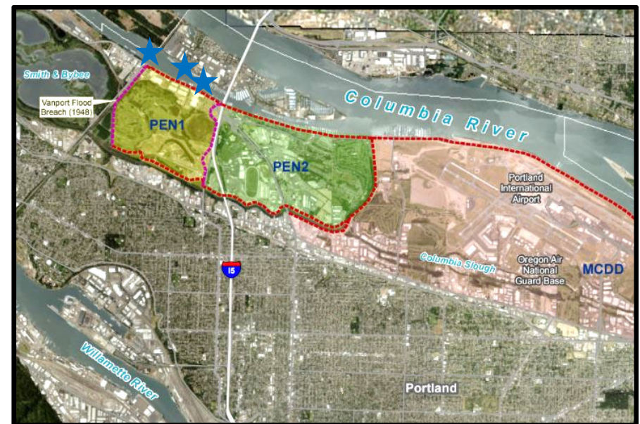
Remaining HTRW Sites